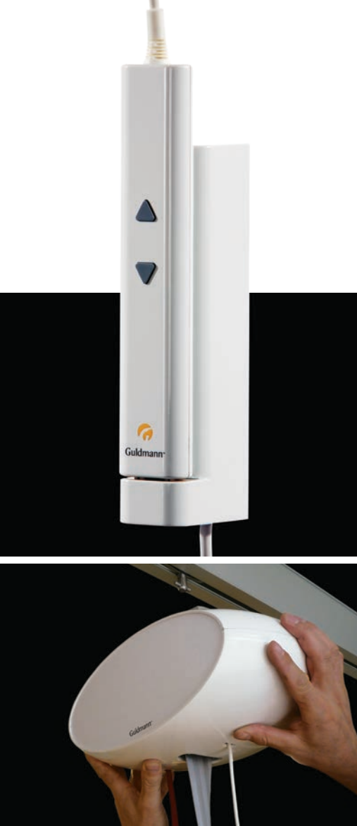
GH1 Q – click on / click off version